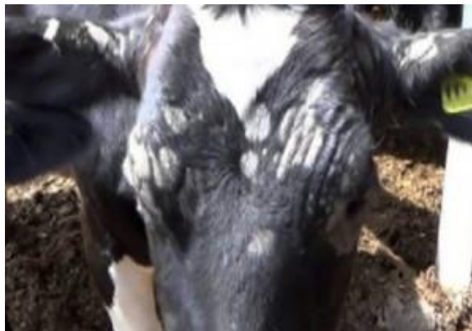
Figure 1 Diseased animal

Objective. The aim of this study was the isolation and identification of the causative agents of ringworm in cattle, as well as a comparative evaluation of the therapeutic efficacy of the LTF-201 “Arm” vaccine in combination with the immunomodulatory Myxoferron and the topical dextrotropic drug Akamiksán, compared with the use of the LTF-201 “Arm” vaccine combined with the topical agent Akamiksán without immunomodulatory support. Additionally, the study aimed to analyze the dynamics of clinical condition in animals during treatment and to determine the duration of reparative recovery in the post-therapeutic period. This allowed the identification of optimal approaches for therapy correction and the development of recommendations to reduce treatment duration and improve overall therapeutic efficacy.